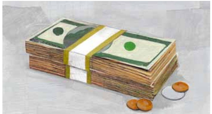
Illustrations by Darren Booth

Over the past century these instruments have destroyed the purchasing power of investors in many countries, even